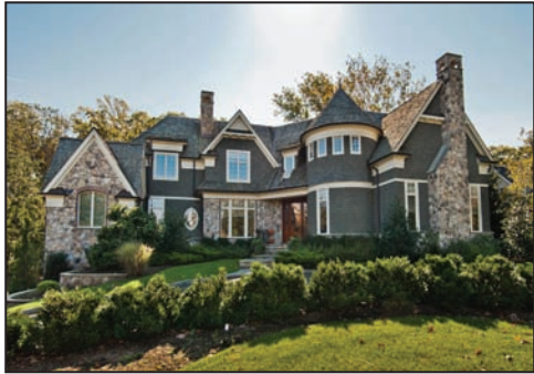
293 Hartshorn Drive, Short Hills