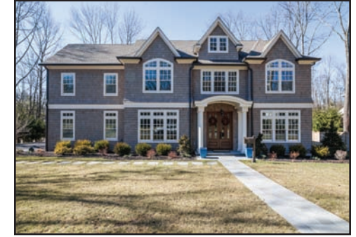
477 Long Hill Drive, Short Hills