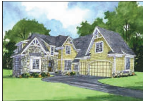
28 Inverness Court, Short Hills