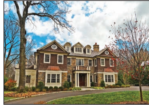
15 Slope Drive, Short Hills