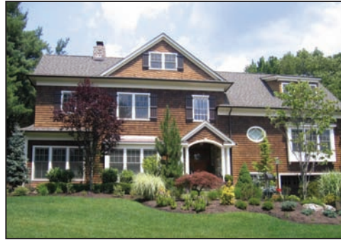
55 Hilltop Road, Short Hills