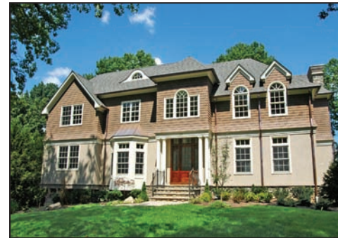
33 Lee Terrace, Short Hills