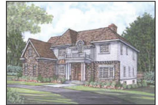
465 Long Hill Drive, Short Hills