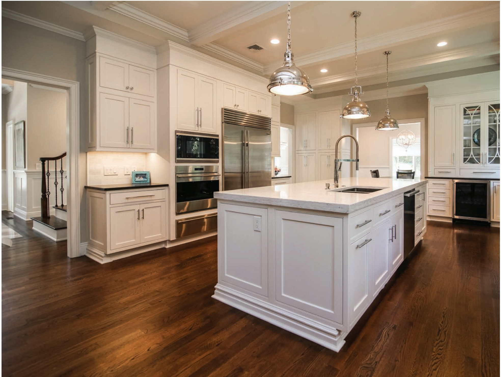
Geiss Custom Builders Most Recent Sale, 175 Long Hill Drive