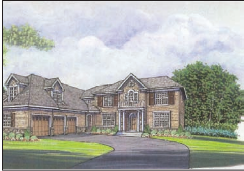
15 Addison Drive, Short Hills