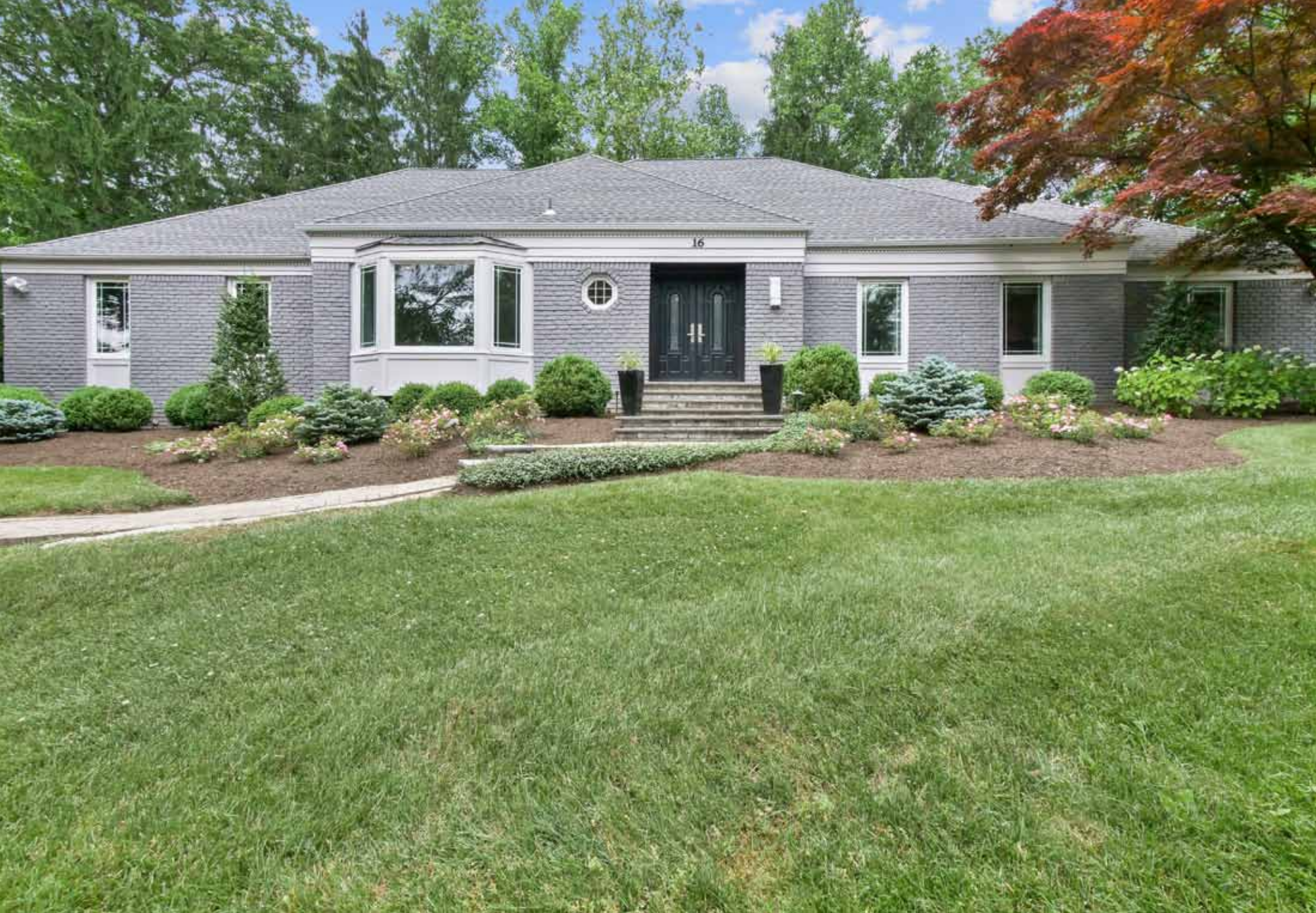
16 Dominick Court || SHORT HILLS