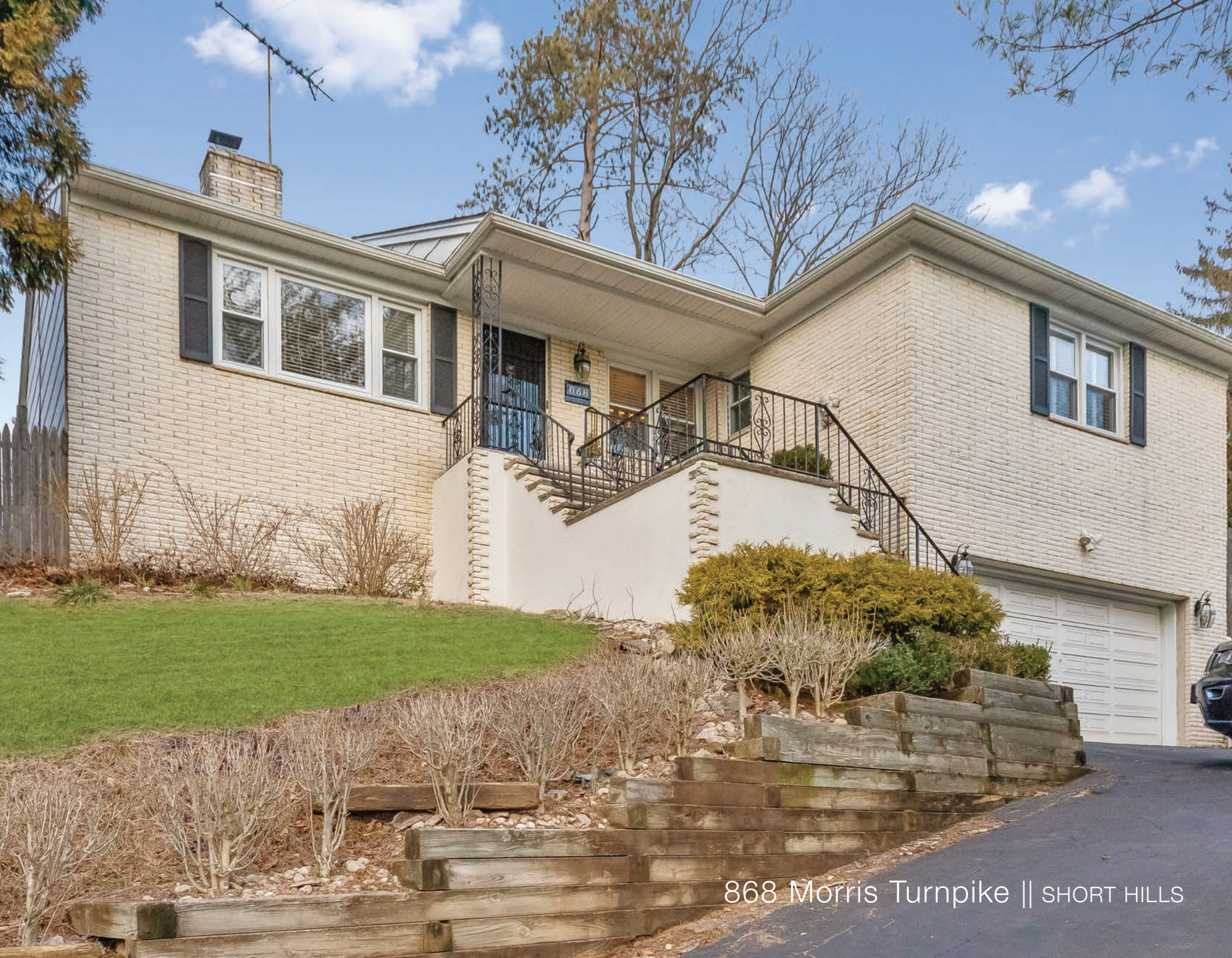
868 Morris Turnpike || SHORT HILLS