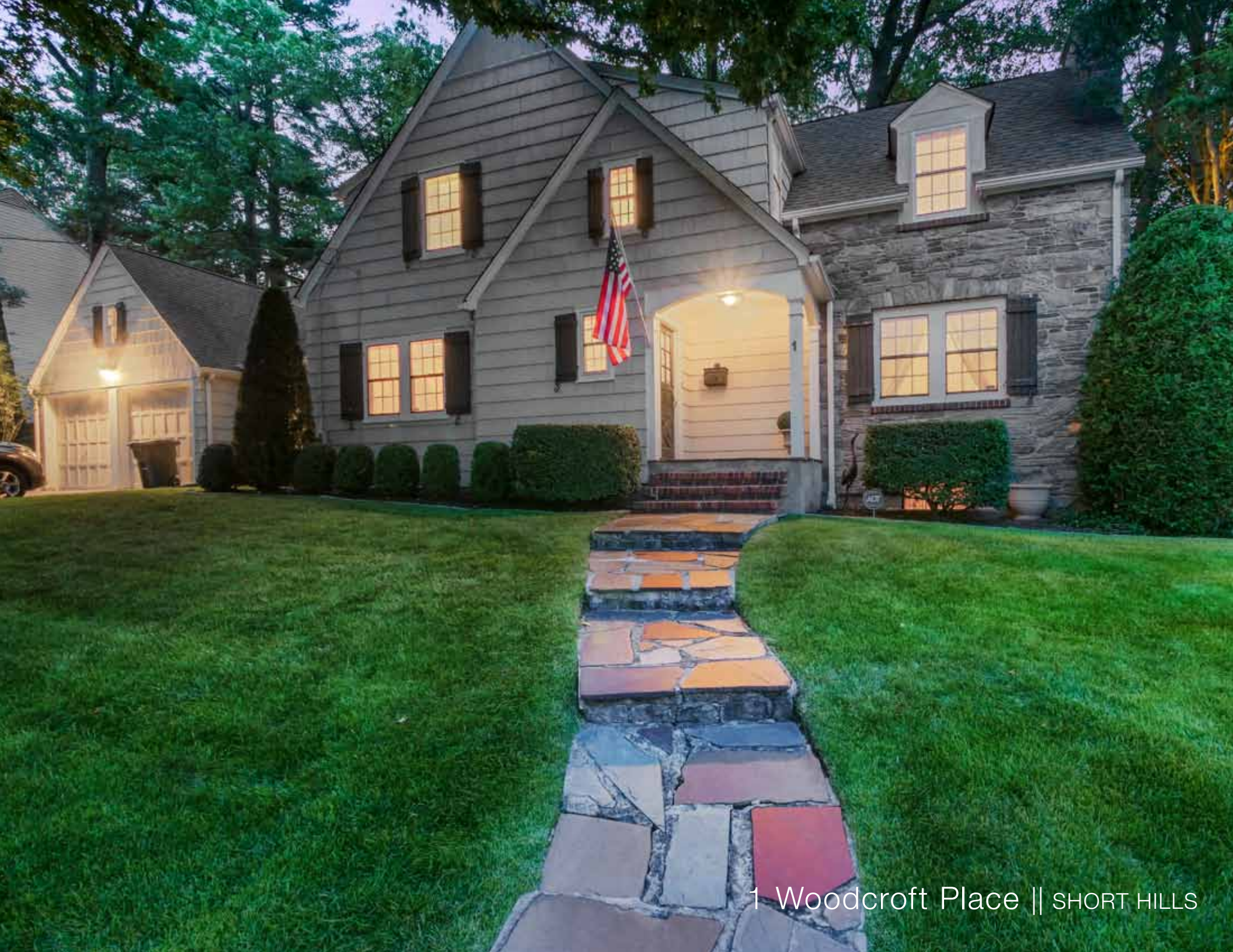
1 Woodcroft Place || SHORT HILLS