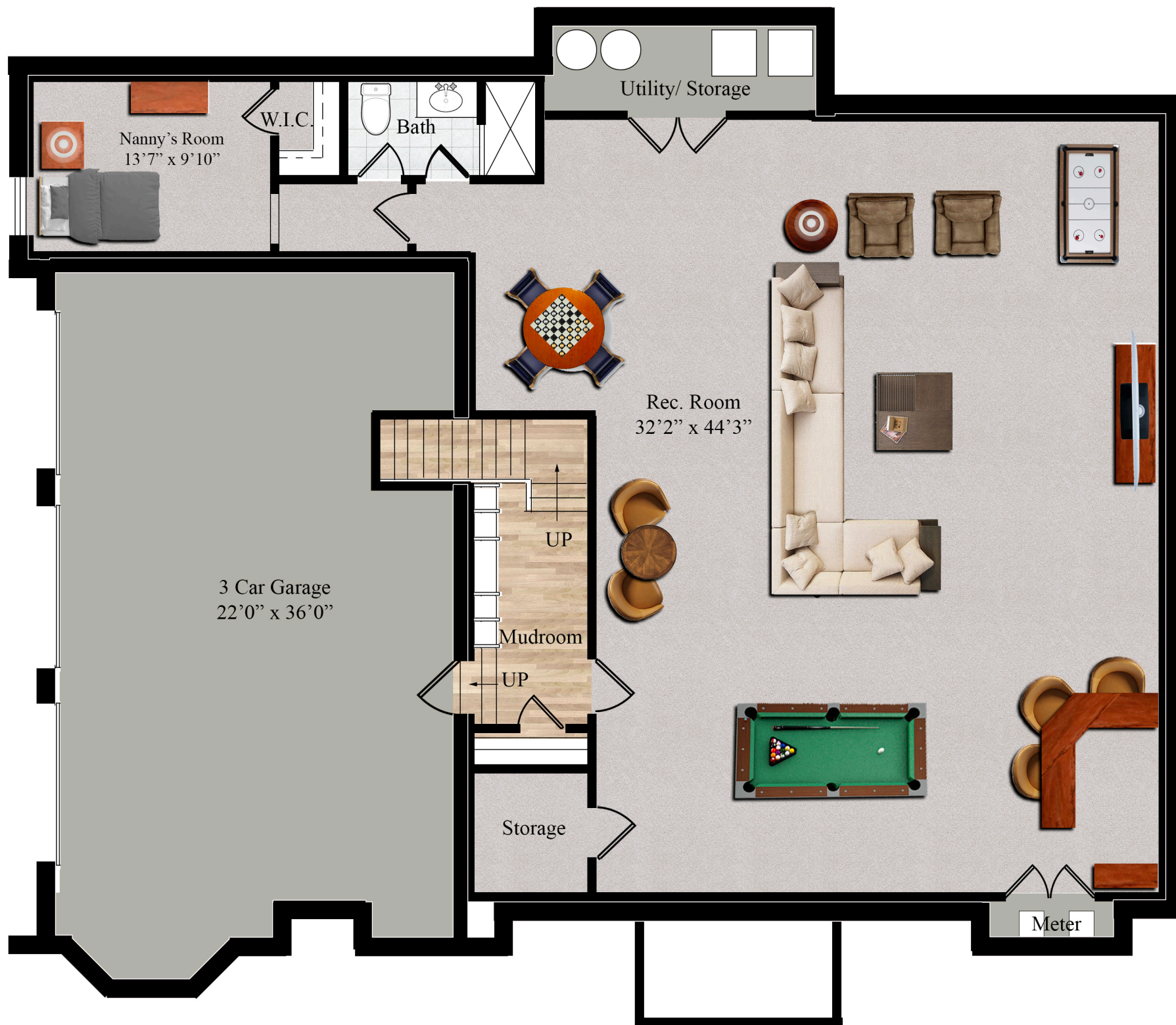
Foundation Plan 2379 S.F.