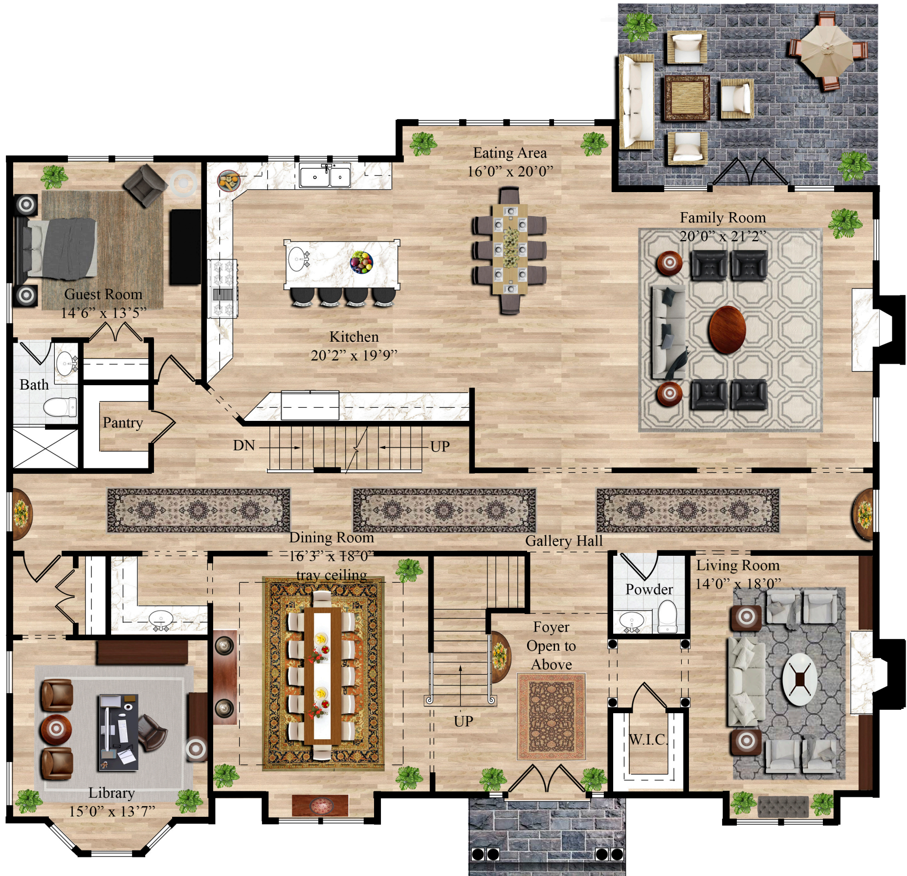
First Floor 3,395 S.F. 9' ceiling