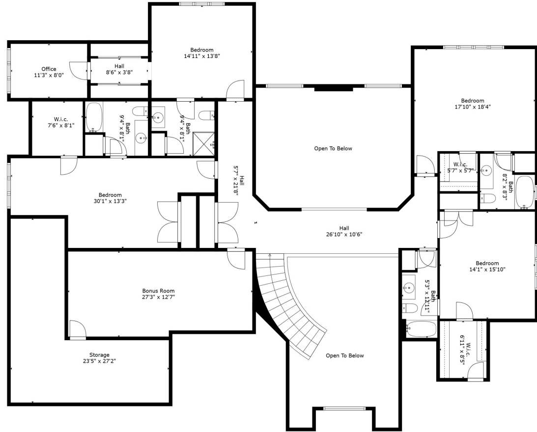
1 Lockhern Drive - Livingston, NJ SECOND FLOOR