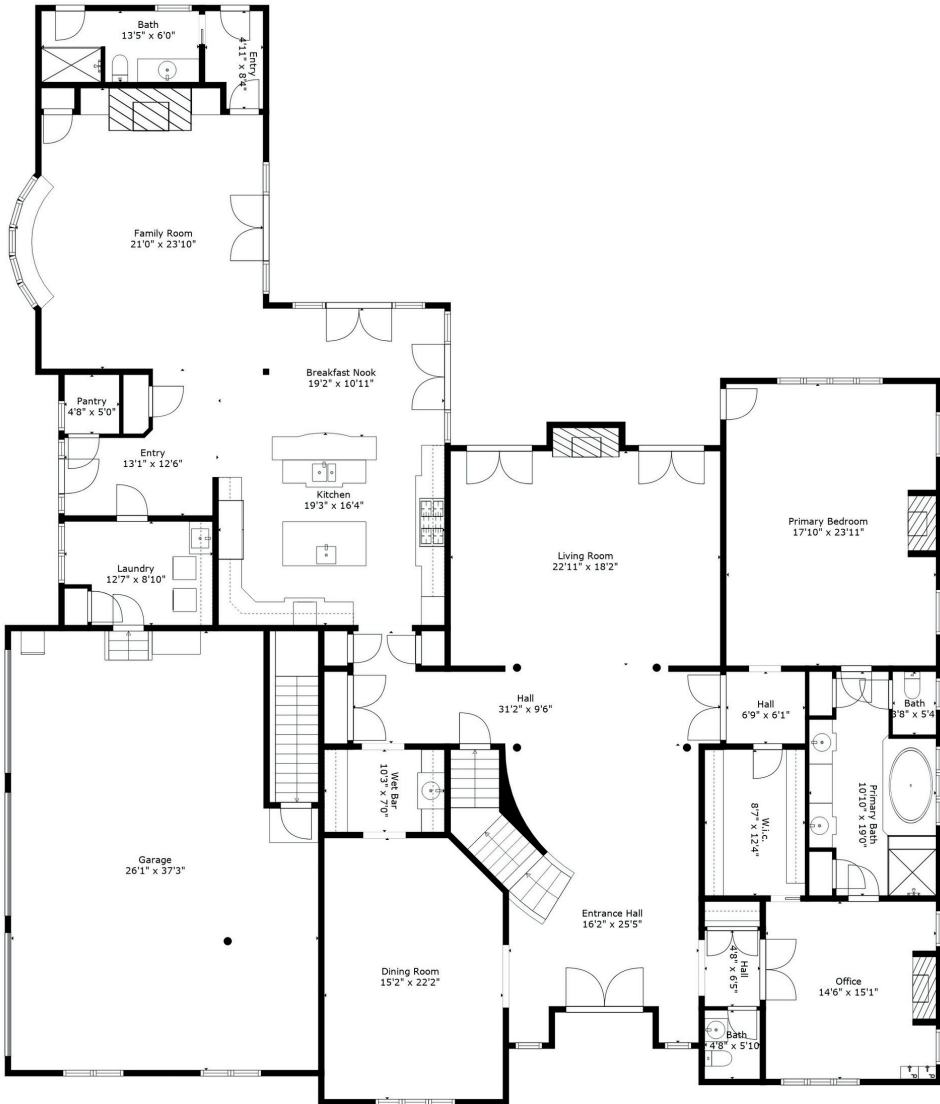
1 Lockhern Drive - Livingston, NJ FIRST FLOOR