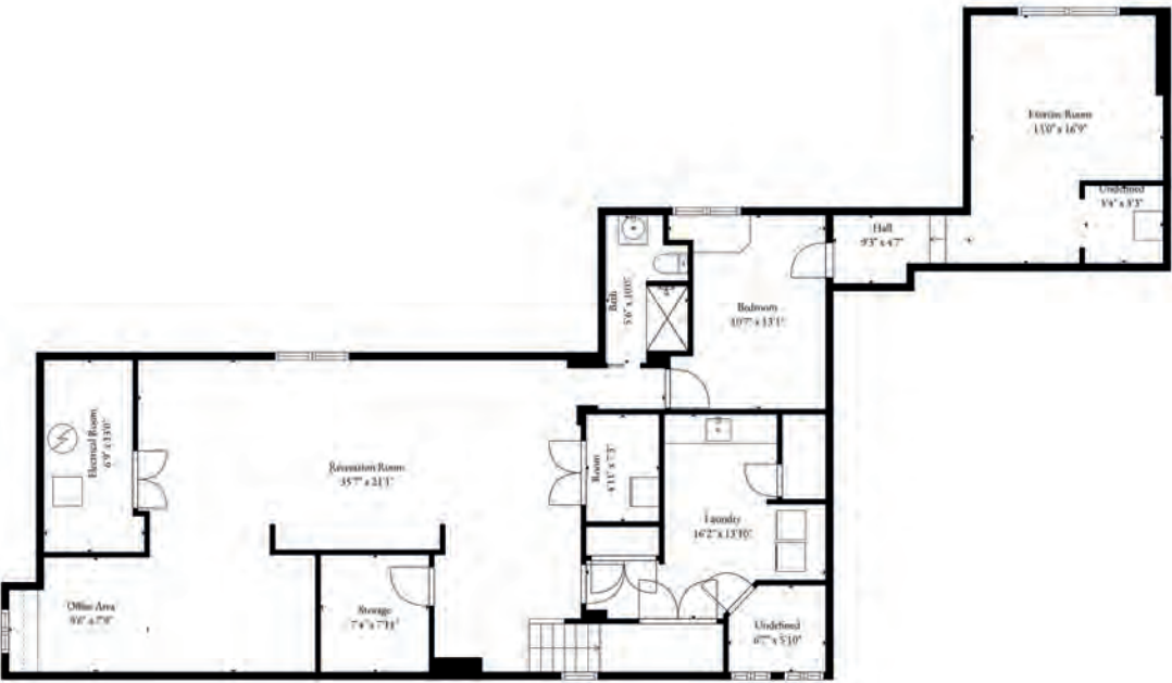
10 Nottingham Road - Short Hills, NJ Lower Level