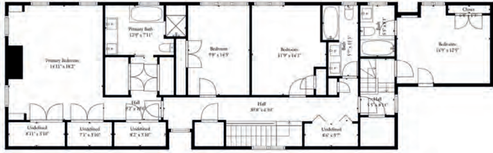
10 Nottingham Road - Short Hills, NJ Second Floor