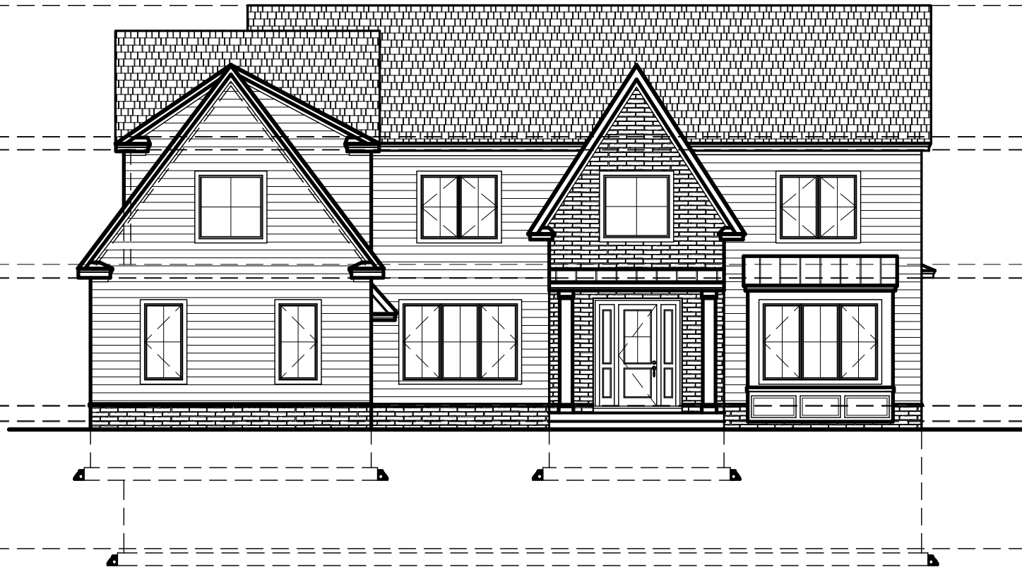
FRONT ELEVATION 105 FARLEY ROAD, SHORT HILLS THOMAS BAIO ARCHITECT P.C. AIA