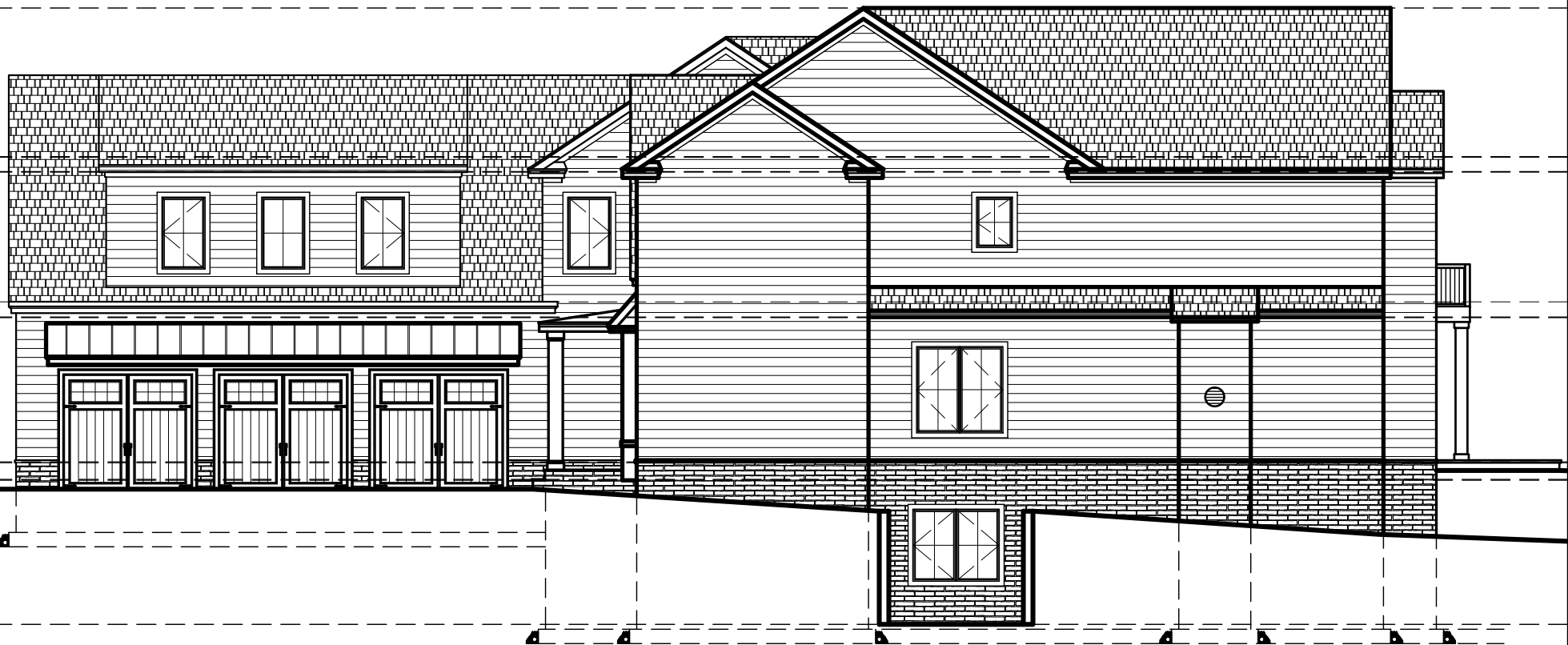
RIGHT ELEVATION 105 FARLEY ROAD, SHORT HILLS THOMAS BAIO ARCHITECT P.C. AIA